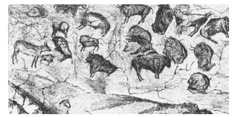
Altamira cave painting